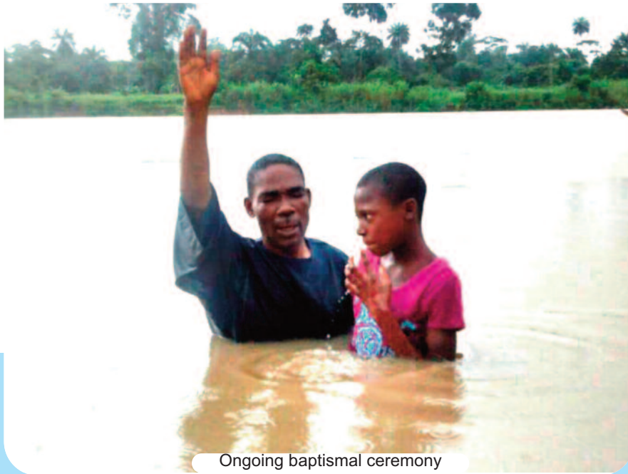
Ongoing baptismal ceremony

The newly organized National Association of Adventist Corp (NAAC) members have led 40 persons to Jesus in the Island of Egbopuloama, Southern Ijaw Local Government Area in Bayelsa State, Nigeria.