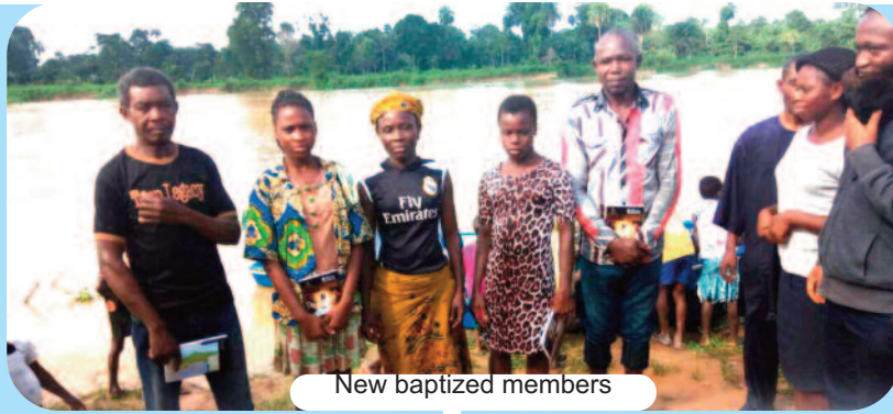
New baptized members

The crew also ran Vacation Bible School and Literacy Classes where the teachers among the Corps members taught children aged 5 to 15 how to read and write. At the end of the one week gospel campaign and community service, 28 adults were baptised and a new church planted in Egbopuloama. Follow up activities by global mission pioneers have yielded 12 additional souls, including the deputy chief of the Island.