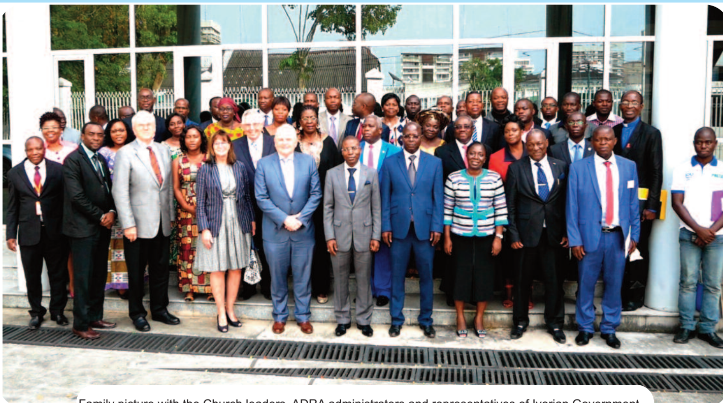
Family picture with the Church leaders, ADRA administrators and representatives of Ivorian Government

and the Church. The purpose of this donation is to help equip UCH, RHC and General Hospitals all over the nation (14 health centers).