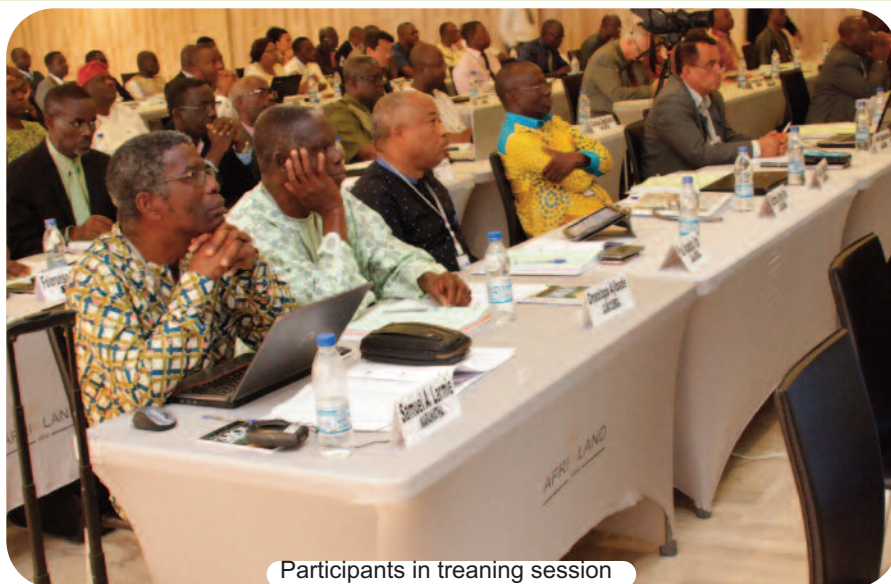
Participants in training session

The Seventh-day Adventist Church in the West-Central Africa Division held her Year-End meeting in Grand Bassam, Côte d'Ivoire, from the 29th to the 31st of October 2017. Delegates who came from all over the 22 countries of the Division territory met in Afrikland Hôtel to evaluate their past activities and also plan for 2018.