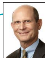
Ted N. C. Wilson is president of the Seventh-day Adventist Church.