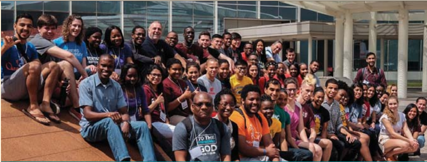
More than 70 students and several campus ministers from around the NAD, Dominican Republic, and Germany attended this year's ACF Institute.

studies based on the book of Acts. The rest of the day included worship and sessions covering such topics as how to start and grow a campus ministry, leadership development, discipleship, apologetics, and personal evangelism. Students also participated in outreach at the university and other parts of Houston by doing random acts of kindness and inviting people to have “free intelligent conversations” with them.