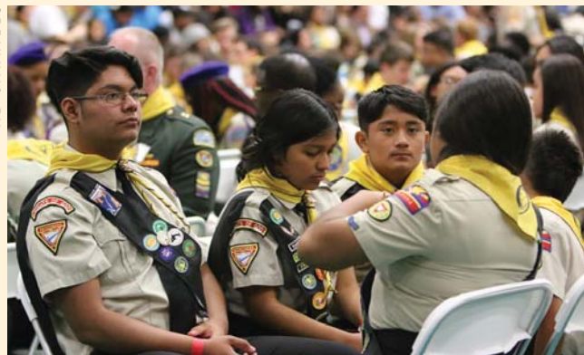
Pathfinder teams get ready for Pathfinder Bible Experience testing at the 2016 event in Arizona.